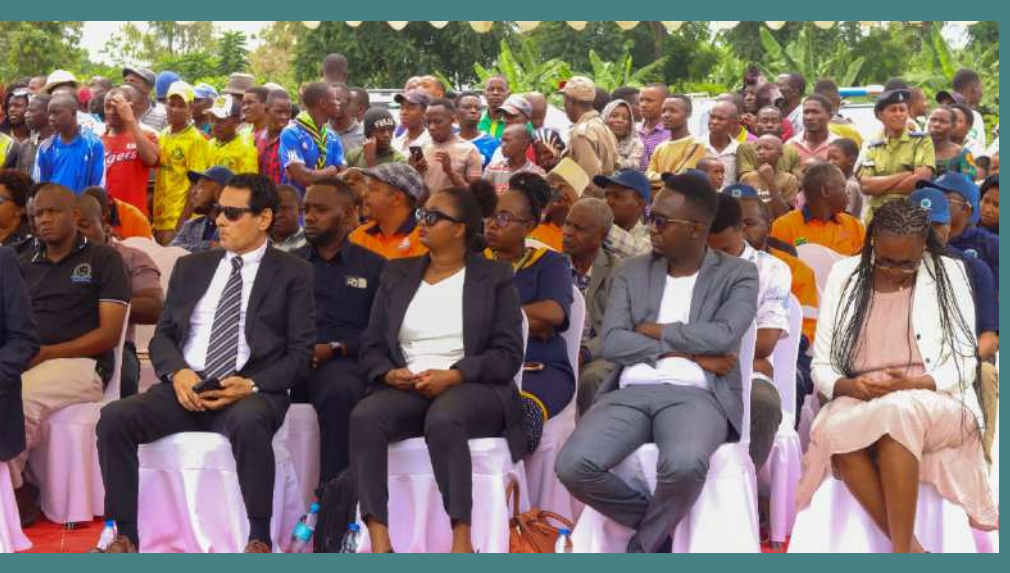
Residents pays attention to a speech from the Deputy Minister of Works, Eng. Godfrey Kasekenya, during the signing of the contract for the construction of the Sengerema - Nyehunge road and the ferry in the region.

He said at least five projects for the construction of new ferries were undergoing with 18 projects in repair of ferry and infrastructure to the tune of Sh60.72billion.