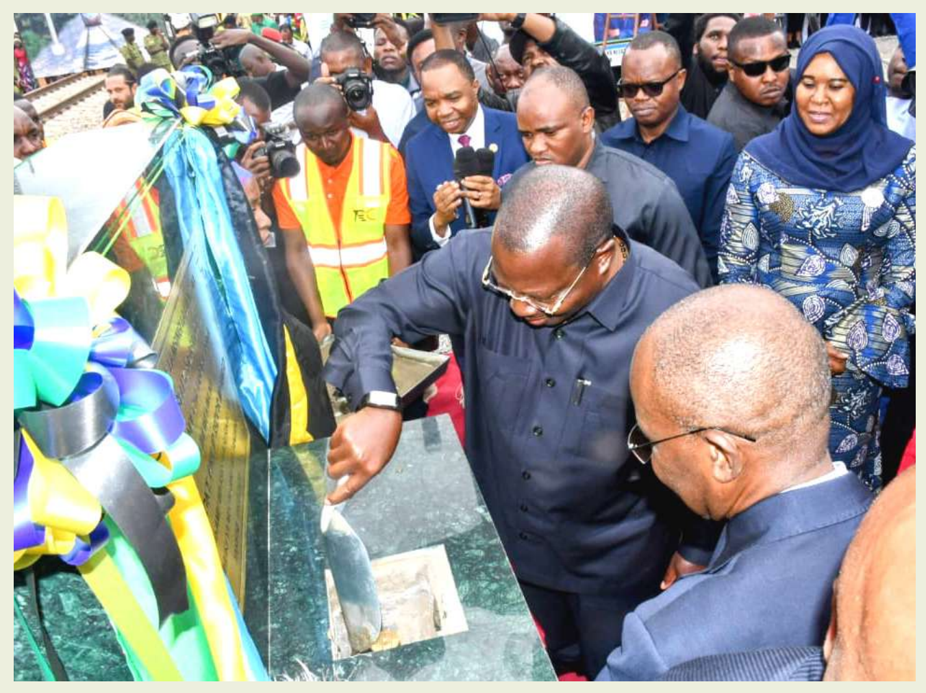
Vice President Dr. Philip Mpango makes a cement mark to signal the laying of a foundation stone for the construction of the 165km Tabora-Isaka section of the SGR project.

The government will continue to ensure that all strategic infrastructure projects are developed and completed to stimulate economic growth.