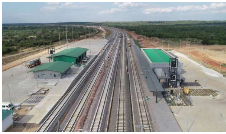
One of the modern railway station, part of the (300km) Dar es Salaam - Morogoro route at Soga area in the Coast Region.