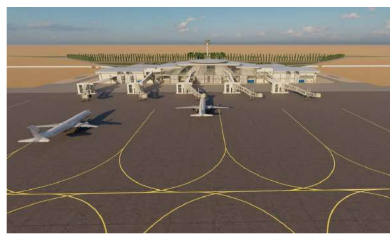
A computer generated image showing a view of Msalato International Airport in Dodoma once its construction is completed