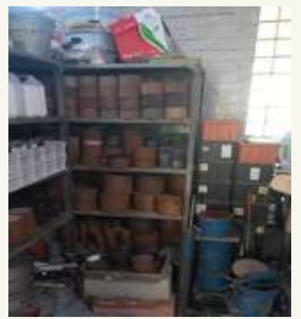
Samples for test at the facility Laboratory

as compared to cement modified/stabilized flexible and rigid road design and thereby substantially reducing construction costs.