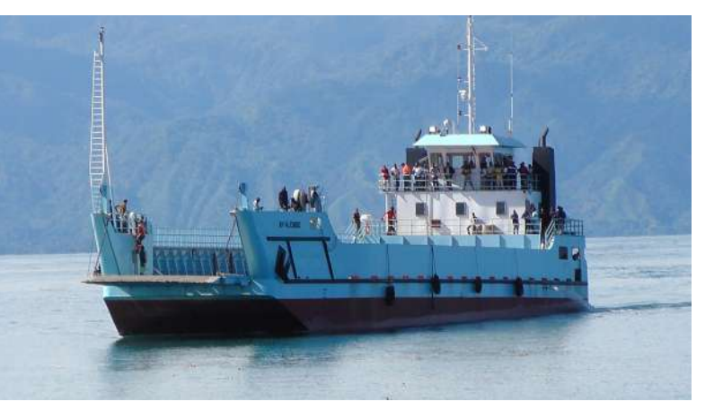
The new cargo ship, MV. Njombe which provides services between the port of Itungi-Mbamba-Bay and the neighboring country of Malawi in Lake Nyasa.