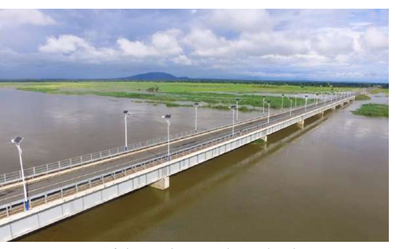
Magufuli Bridge at the Kilombero River in Morogoro Region. The bridge is 384 metres long