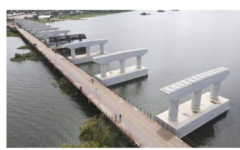
The construction of JP Magufuli Bridge (kigongo – Busisi), in Mwanza region now reaches 72 percent.