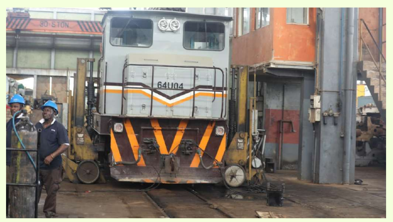
MGR engines, cargo and passenger locomotives undergoing repair at the garage in Morogoro Region recently.

The move, the minister said aims to renovate nine engines to be used for the Central Railway line.