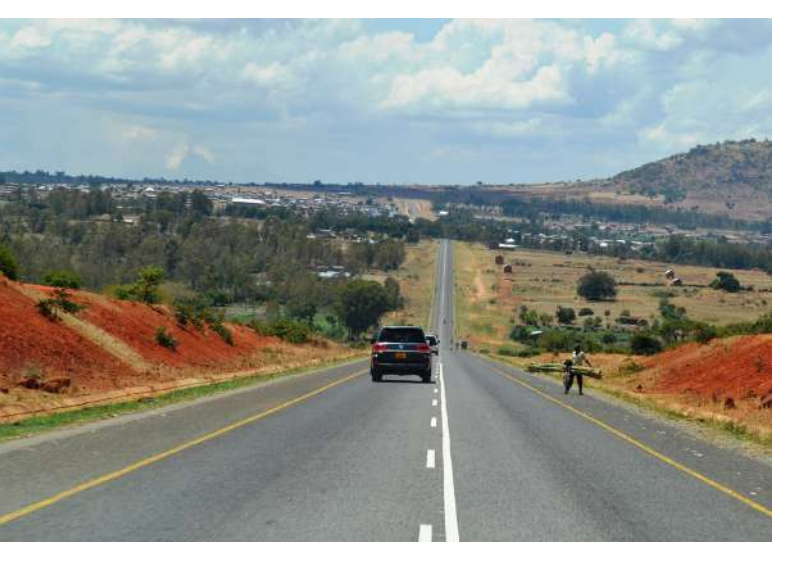
Vehicles seen cruising the 112 km Sumbawanga-Matai-Kasanga Port road in Rukwa Region whose construction to tarmac level has been completed.

Some of the Pictures captured in some of the ongoing projects being implemented during the sixth Phase Government under President Samia Suluhu Hassan.