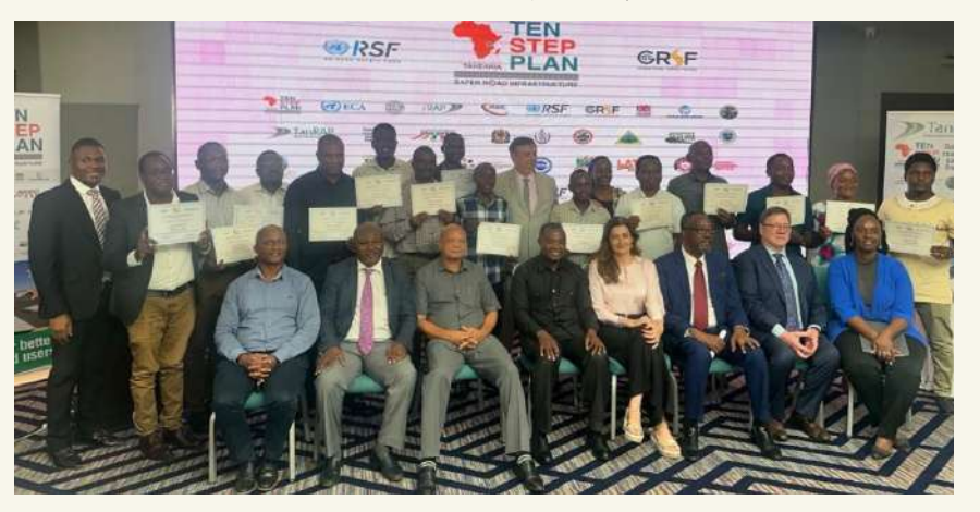
The final group of Road Safety Auditors trained within the project received their certificates during the event

Project results and ongoing TanRAP activity will support the implementation of the Global Plan for the Decade of Action for Road Safety 2021-2030 which provides a road map for how countries can halve road deaths and serious injuries by 2030.