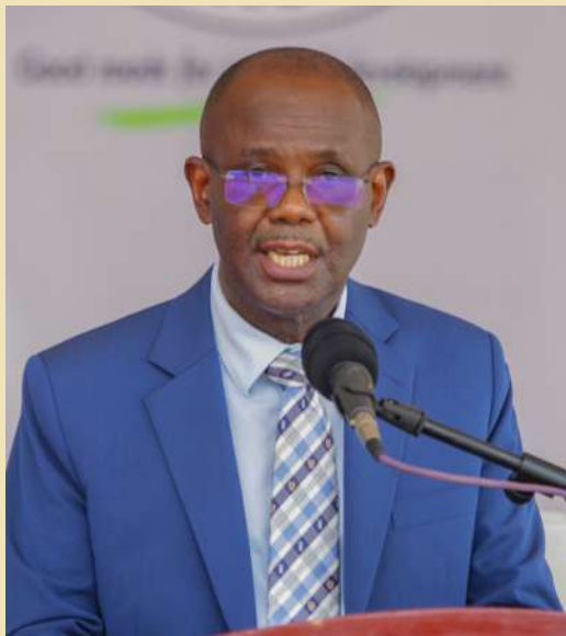
Minister of Works and Transport Pro. Makame Mbarawa

Minister of Works and Transport, Prof. Makame Mbarawa, dissolved the Board of Directors of the Tanzania Ports Authority (TPA), and the Board of Directors of the Marine Services Company Limited (MSCL), in December last year due to negligence and poor projects supervision.