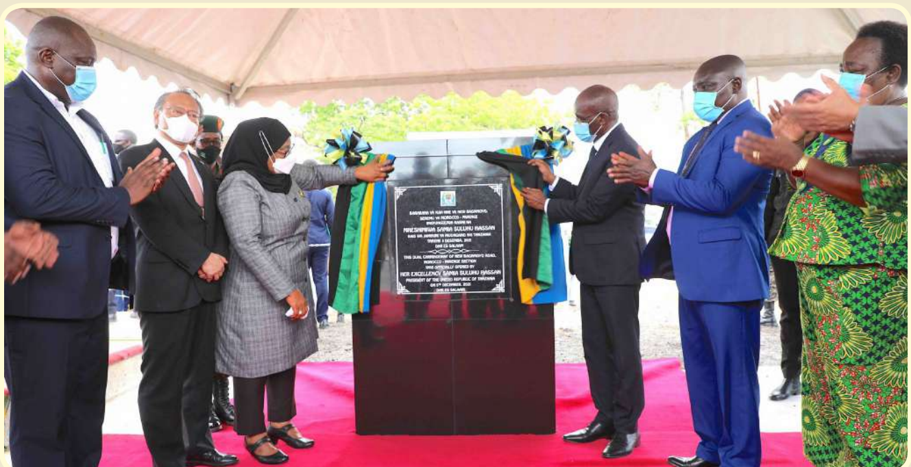
President Samia Suluhu Hassan inaugurates a 4.3 km section of new Bagamoyo Road phase II in December last year, between Morocco and Mwenge in Dar es Salaam

He said the completion of widening New Bagamoyo road will not only reduce traffic congestion but also reduce accidents to the road users and ensure smooth transportation to and from Dar es Salaam city.