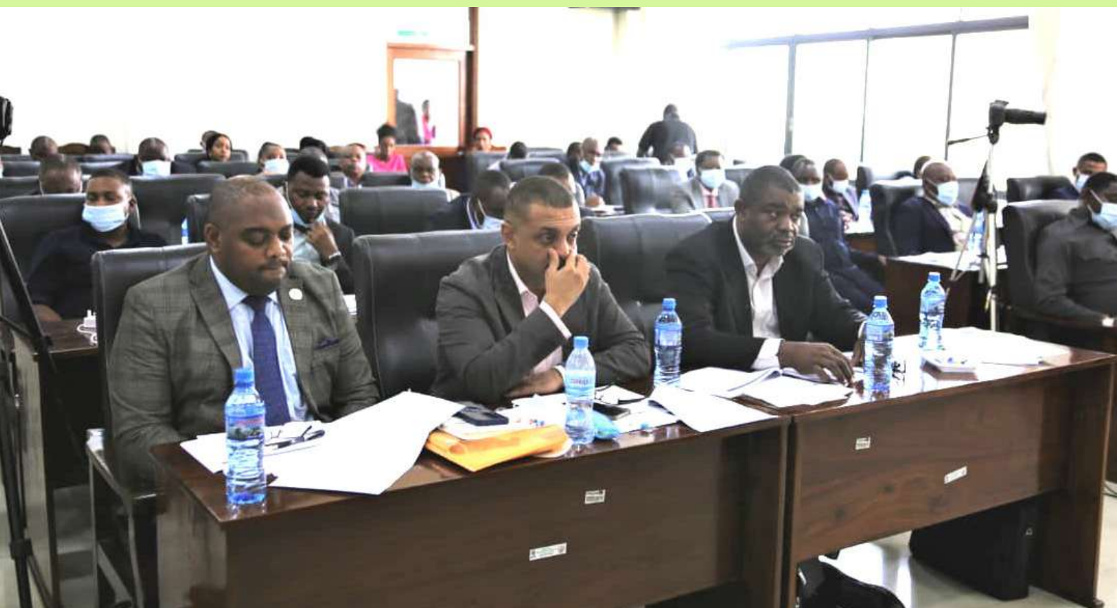
Some participants at the South Co-operating Meeting from Tanzania Mainland and Zanzibar government attentively following up the meeting in Mwanza

The delegates also inspected the construction of the 3.2km John Pombe Magufuli Bridge at Kigongo-Busisi in Mwanza and were satisfied with the construction progress and the technology being used.