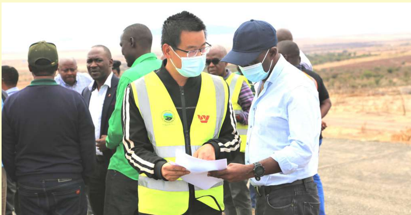
Minister of Works and Transport, Prof. Makame Mbarawa, talks to a Contractor, Staff of Wu Yi Company Constructing the 49km Wasso - Sale road section in Arusha Region.

He said the move will ensure reduction in travel and transportation costs but also reduce travel time.