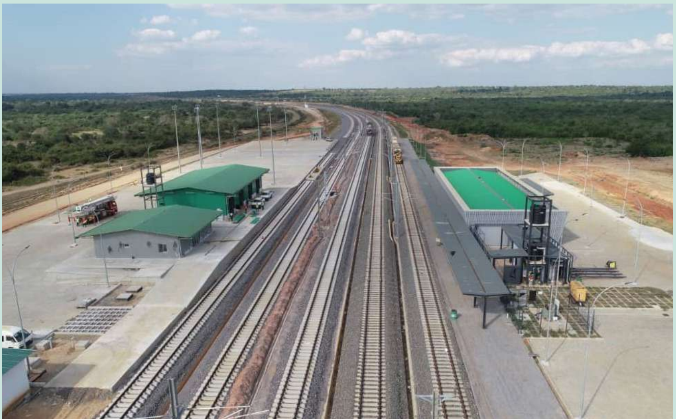
One of the modern railway station, part of the (300km) Dar es Salaam - Morogoro route at Soga area in the Coast Region.

Tanzania Transportation Technology Transfer Centre, C/O Ministry of Works and Transport P. O. Box 2888, 40470 Dodoma. Tel: +255 26 2324455, Fax +255 26 2323233 E-mail: ps@mow.go.tz