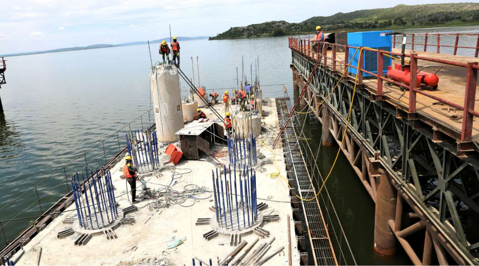
The Work on the construction of the foundation pillars of the JPM (Kigongo - Busisi) Bridge continues in Mwanza Region.

THE Minister of Works and Transport, Prof. Makame Mbarawa, has instructed the Project Manager of the 3.2km construction of JPM Bridge project (Kigongo-Busisi) to ensure they increase the participation of indigenous engineers in its implementation.