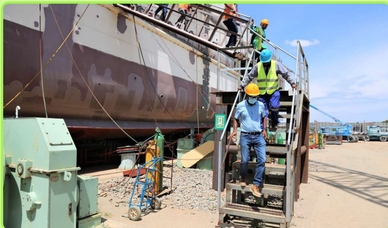
Minister of Works and Transport, Prof. Makame Mbarawa, disembark from the ship during his working visit to inspect the construction of the MV. MWANZA in Mwanza Region.

MV Mwanza construction is being implemented by Gas Entec Company Limited in partnership with Kangnam Corporation all from South Korea in partnership with SUMA JKT of Tanzania, the project is scheduled for completion in September, 2022.