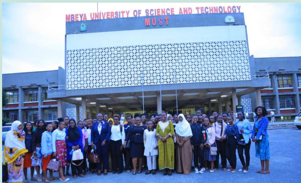
Female Engineers from the Ministry of Works and Transport, (Works), a special unit for women participating in road work, posing for a group photo with students from Mbeya University of Science and Technology (MUST) in Mbeya immediately after providing education related to Construction issues, including Engineering, Architectural Design and Quantity Surveying.

The seminar was attended by over 70 female students engineers who participated in various topic presentations related to road works.